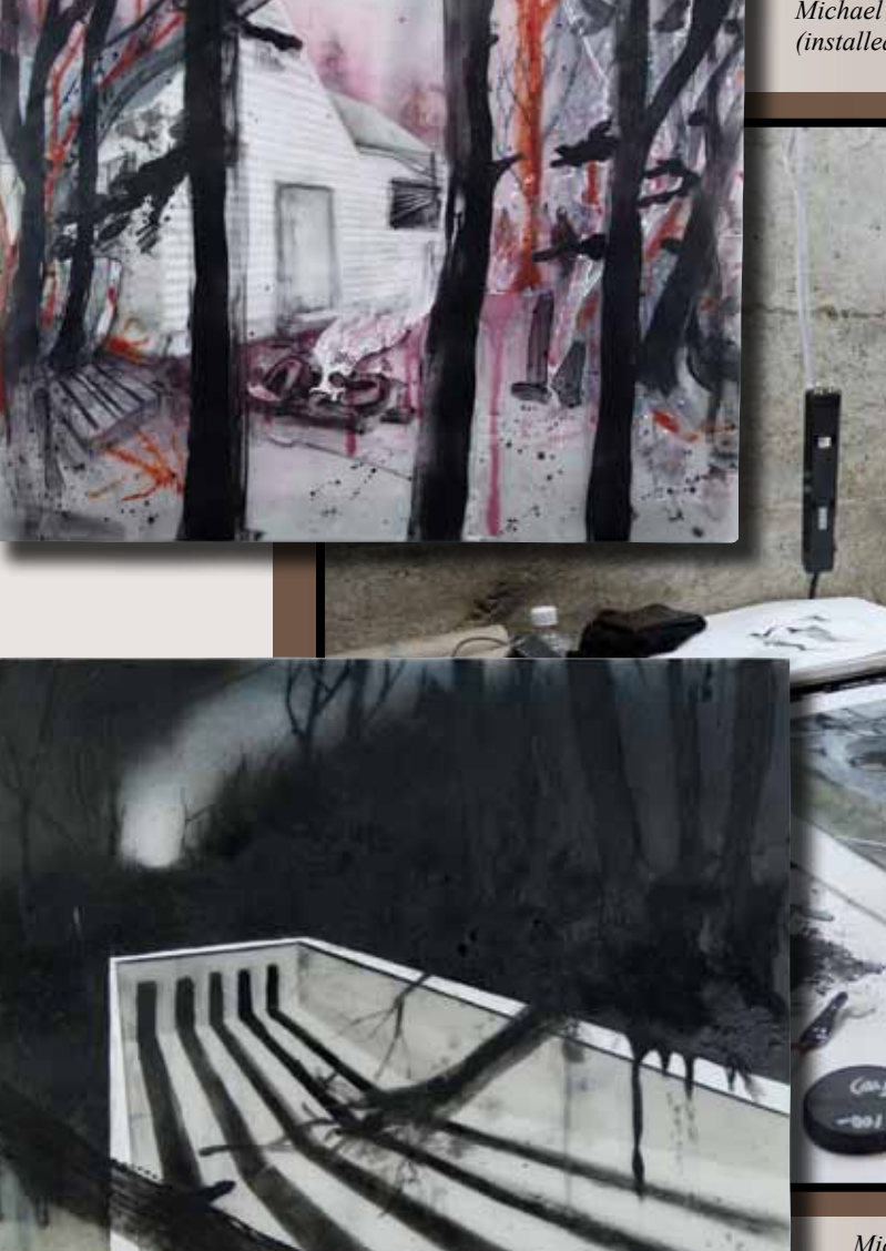
Michael Endo, Smolder, 24-1/8" x 30" x 2-1/4" (installed), kiln formed glass, 2011.